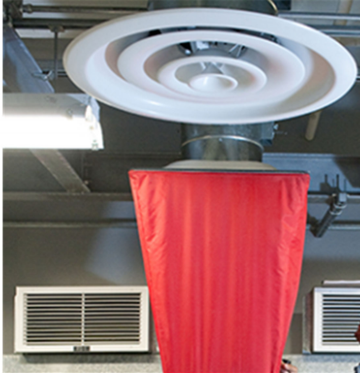
Figure 1 Testing and balancing of HVAC airside components. Source: www.nemionline.org/testing-adjusting-and-balancing-hvac-systems-an-overview-of-certification-agencies/